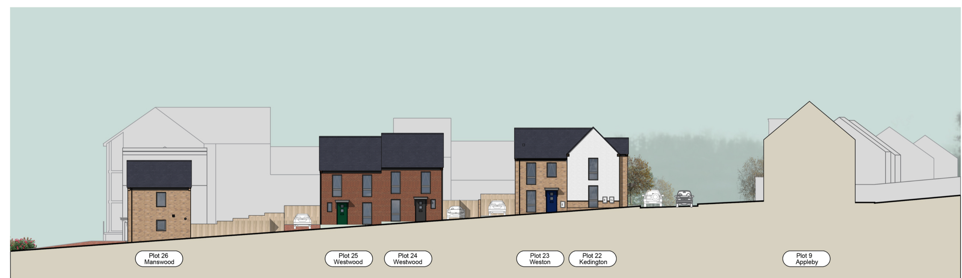
Street Scene C-C

Notes Copyright in this drawing remains the property of BM3 Architecture Limited. Do not scale this drawing. Work to figured dimensions only. Contractors and consultants are to advise BM3 Architecture Limited of any discrepancies.