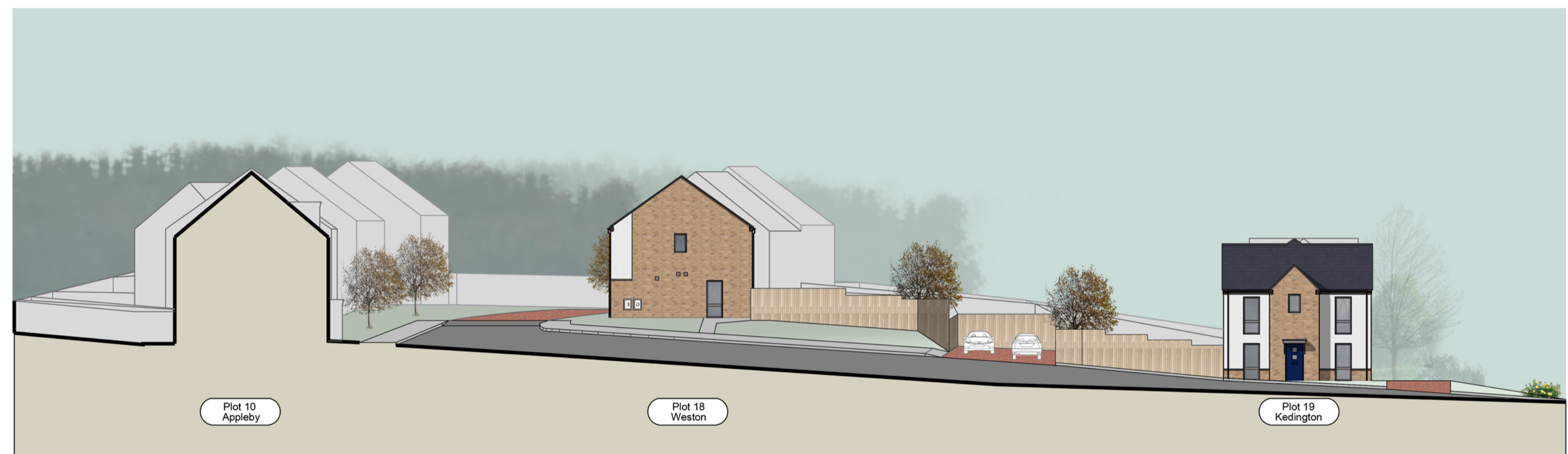
Street Scene B-B