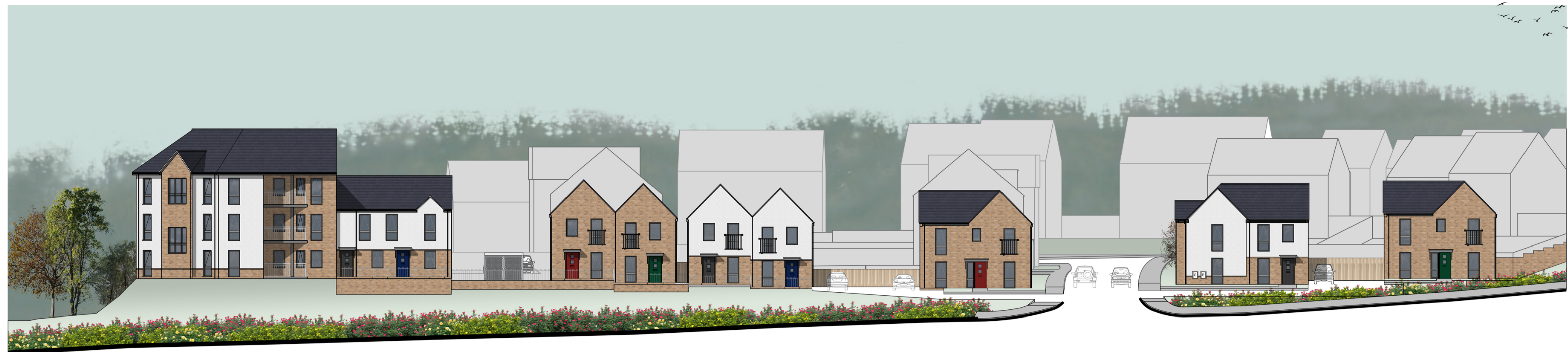
Street Scene A-A Plot 37-42 Freeston 2b3p Plot 35-36 Freeston 1b2p Plot 30 Weston Plot 29 Weston Plot 28 Weston Plot 27 Weston Plot 26 Manswood Plot 19 Kedington Plot 20 Weston Plot 21 Manswood